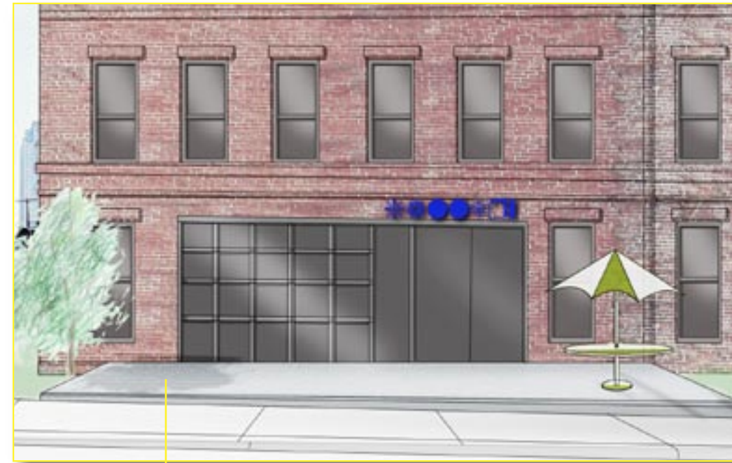
◀ Street Level Gallery, Museum and Retail Spaces: The oldest section of this seven building complex will house nonprofit and for-profit art exhibition spaces.