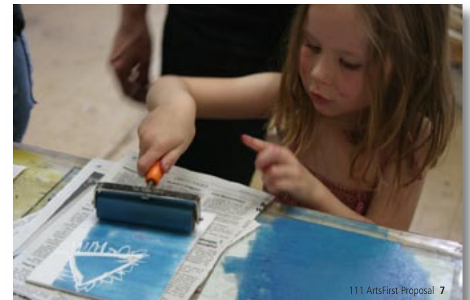
▶ Community Outreach Programs: Art and experiential workshops for seniors, adults, teens and children.