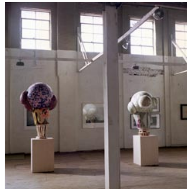
◀ Art Development: Maintain and administer a community gallery.