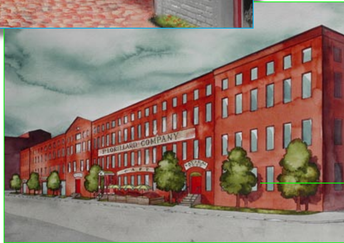
▲ Historical Preservation: Without disturbing the historical character of the P. Lorillard Company manufactory, strategic and much-needed renovation will create inviting and dynamic spaces.